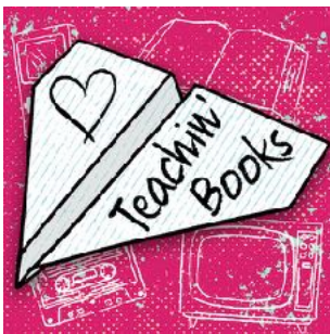
Graphic design by Jade McDougall

In October 2020, I launched a scholarly/pedagogical podcast called Teachin’ Books, all about the ways people teach, learn, and work with literature. It features interviews with people from a variety of informal and formal teaching and learning contexts – such as higher education, K-12 education, book clubs, local theatre, city tour guiding, and more – and it also includes solo episodes in which I talk about the ways I teach literature and other cultural works in undergraduate English classes. All the episodes can be found at https://teachinbooks.com/ or on most podcasting apps.